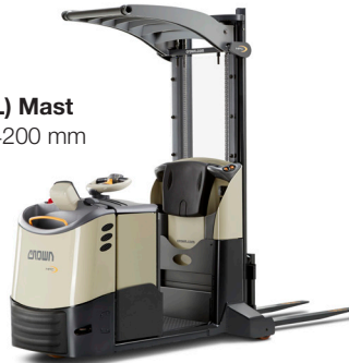
Simplex (TL) Mast Lift Height: 4200 mm